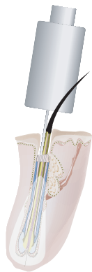
Modern electrolysis, the Apilus® way

Schedule an appointment today to take advantage of Apilus® technology.